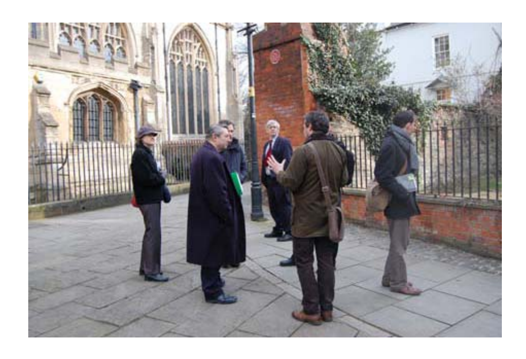
A Placecheck in progress